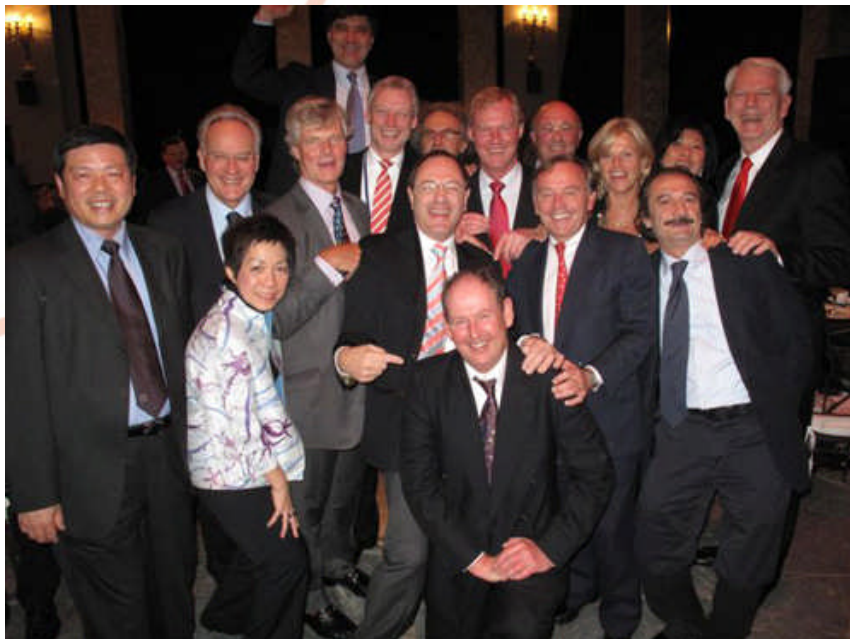
Exhibition Industry CEOs "Networking" at the UCF in Madrid!

93% of participants felt the event met their expectations, so CEOs will certainly be marking this on calendars as a "must" event for January 2010.