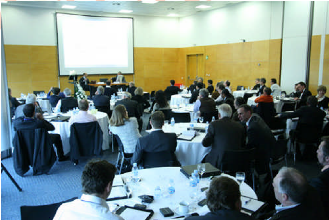
Exhibition Industry CEOs working hard at the UFI CEO Forum in Madrid.

On the more positive side, he felt that “when recovery does come, it will be sharp. But, the question is - when?”