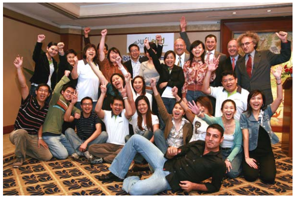
Happy graduates of the first UFI EMD programme. August was historical for these students and for UFI. 5

The course is divided into 4 modules, of which 2 were in the host country in March and August