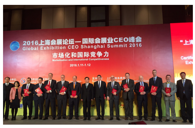
Photo: Advisors of the Exhibition and Convention Industry in Shanghai.

The city of Shanghai has invited a number of representatives of the global exhibition industry to become 'Advisors of the Exhibition and Convention Industry in Shanghai'.