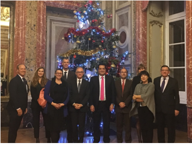
Photo: Invited by his Excellency Andrzej Byrt, GED task force at the Polish Embassy in France.