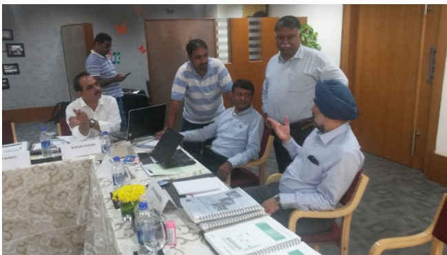
Photo UFI-EMD in India.