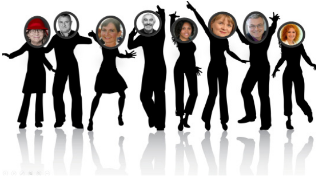
Photo: Speakers of the 2015 ICCA Research, Sales and Marketing.