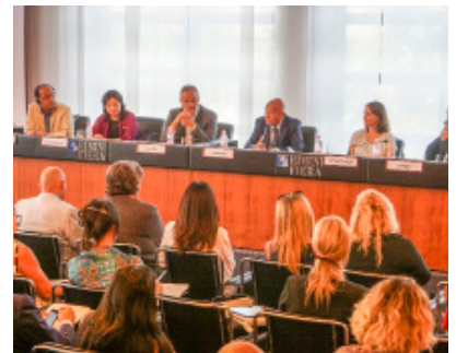
Photo: AEFI meeting.