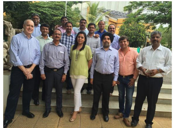
Photo: Graduates UFI-EMD in India.

It was great to see that participants from service providers such as the freight forwarders R.E. Rogers or Orient Marine Lines also found the content and the teaching methods, helpful and promising to enhance their daily work.