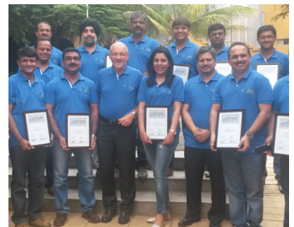
Photo: UFI-EMD in India.