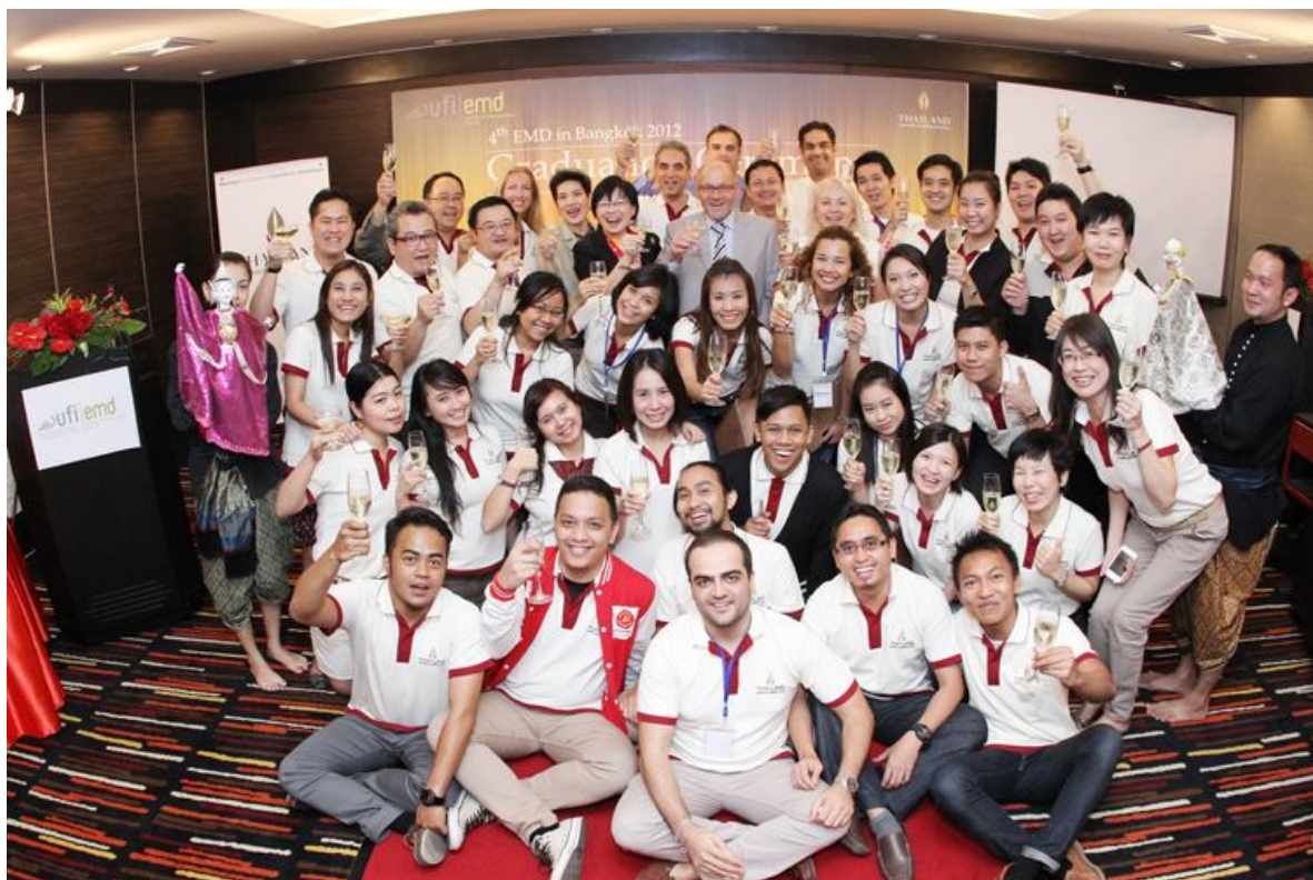
In September 2012, 34 middle and senior level project managers from 7 countries graduated in the UFI-EMD Programme in Bangkok.

If you'd like additional information on the UFI EMD programme, please contact emd@ufi.org or consult: www.ufi-emd.com