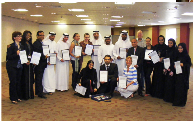
UFI-EMD Dubai Class of 2009

Complete programme and registration information may be downloaded at http://bit.ly/qtZZDI For all UFI-EMD related questions please contact emd@ufi.org .