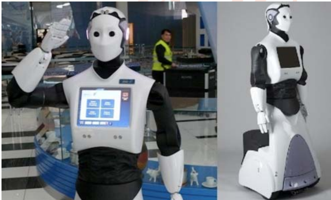
A PAL robot will welcome you at the UFI Congress in Valencia!

There are still a limited number of sponsorship opportunities for Valencia, as well as for a number of UFI events and programmes in 2012. If you would like to find out more about the benefits for your organization of reaching the exclusive UFI global community, please contact nick@ufi.org .