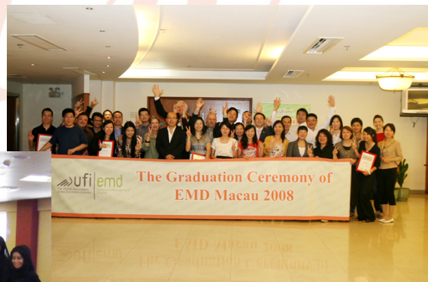
UFI-EMD Macau Class of 2008