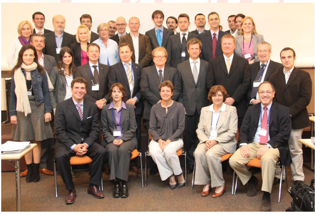
April in Paris provided participants with some excellent networking opportunities at UFI Operations Focus Meeting.