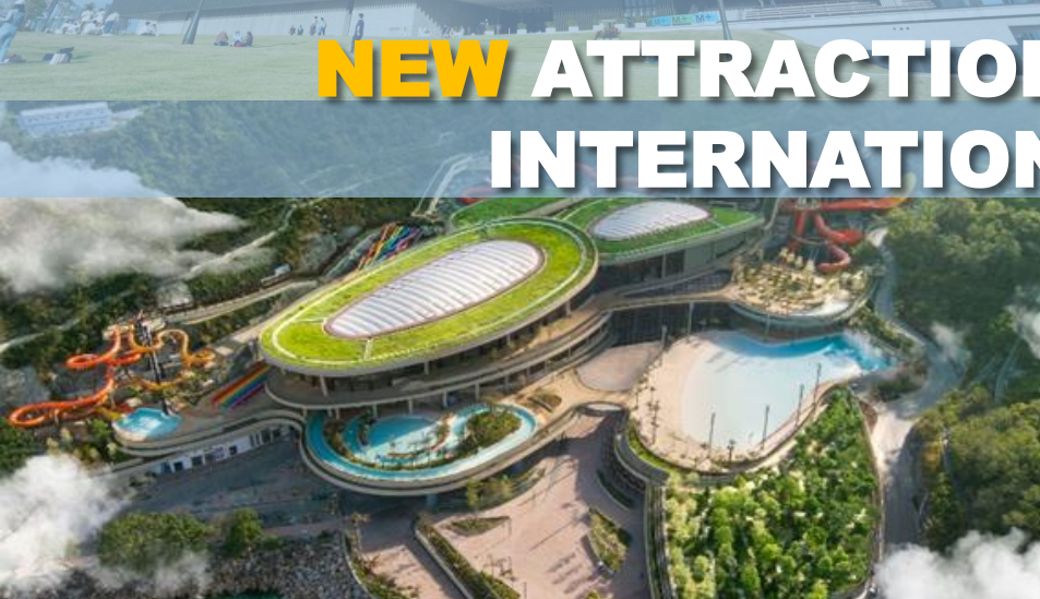
Water World Ocean Park