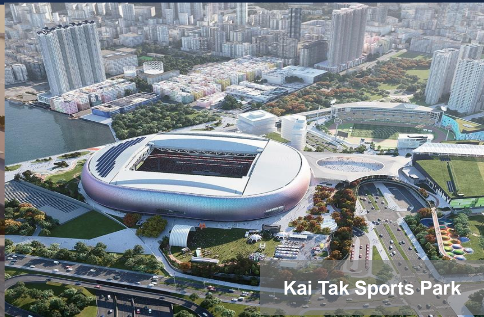
Kai Tak Sports Park

Hong Kong's largest hub for Retail, Dining and Entertainment and Professional Services