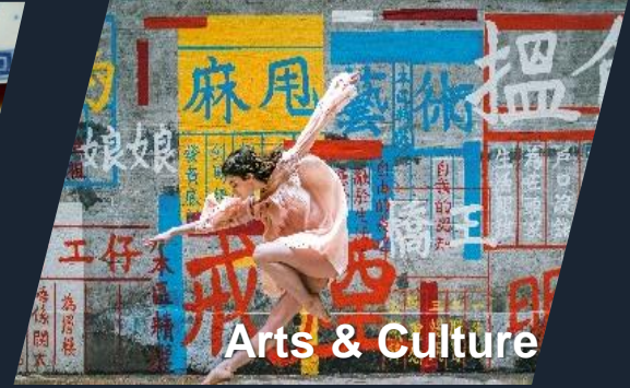
Arts & Culture