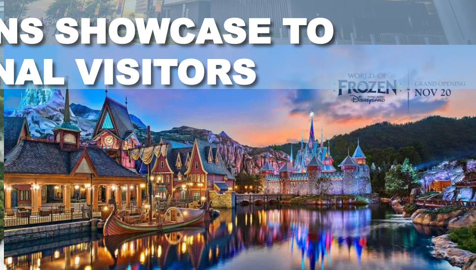
Hong Kong Disneyland